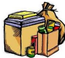
Food Pantry Donations Needed