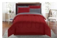
Twin size bed in bags

Bedding is so important to us because the shelter clients take this with them when they move into their own apartments