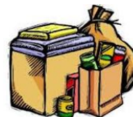
Food Pantry Donations Needed

Bottled Water, Sandwich-size Zipper Bags, Coffee Creamers